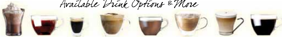
Hot Cocoa Coffee Mild Espresso Cappuccino Cafe Mocha Cafe Latte Mochaccino Coffee Bold