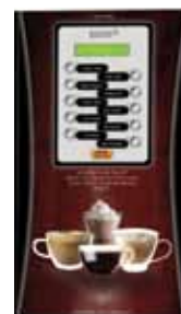
Burgandy Style Still Available just ask for the machine with PN: 123046 front label.