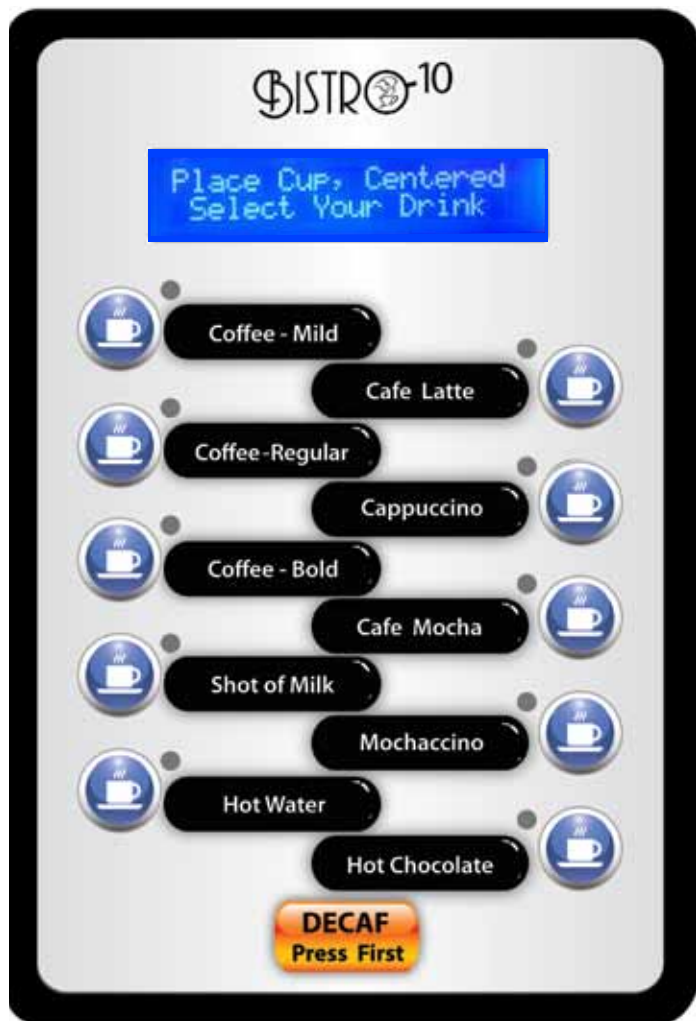
Close-up of membrane switch showing our standard drink options

Bistro 10-T entire front can be custom branded with your image helping you to promote your brand and services.