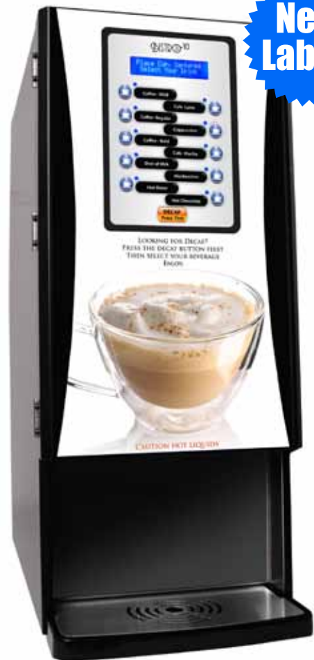
Bistro 10-T PN: 123033-BPC